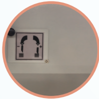
Adjustable cutting depth from the outside of cutter