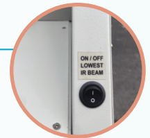
Deactivatable lower IR beam Suitable for long paper