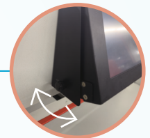
Angle-adjustable 7" big touchpad