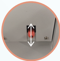
Safe & simple replacement of cutting stick