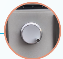
Electronic hand wheel for fine-adjustment