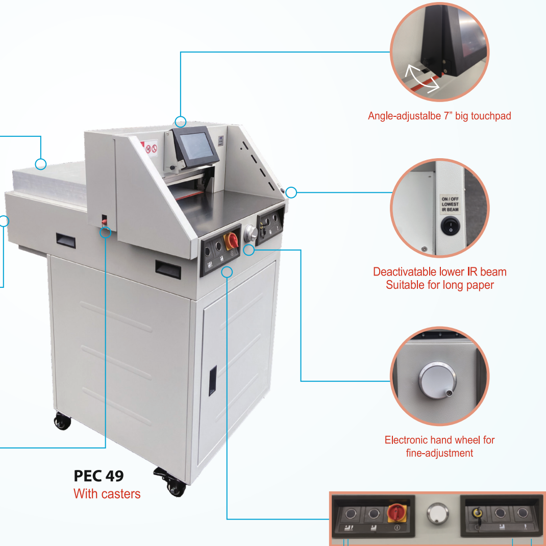
PEC 49 With casters