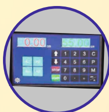
Big touch panel